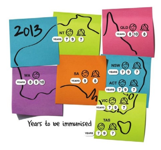
Figure: Human papillomavirus vaccination delivery schedule, Australia, 2013 to 2014, by year level, sex and state or territory