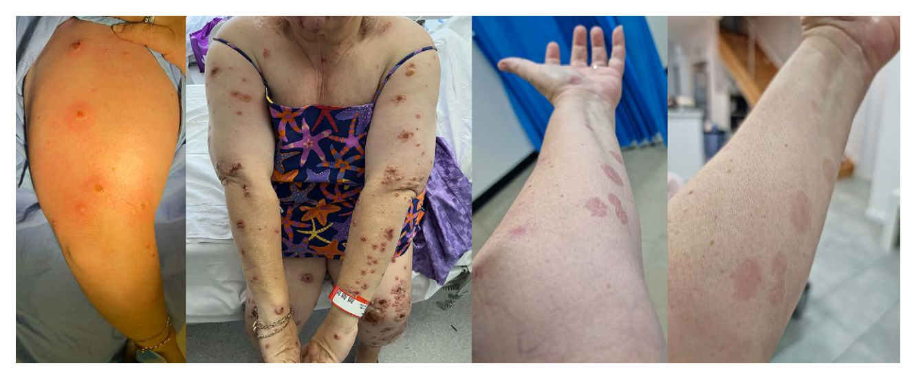
Figure 4: Progression of lower limb rash (from left to right): 9 days post exposure, 12 days post exposure, 5 weeks post exposure and 9 weeks post exposure

Figure 3: Progression of upper limb rash (from left to right): 9 days post exposure, 12 days post exposure, 5 weeks post exposure and 9 weeks post exposure