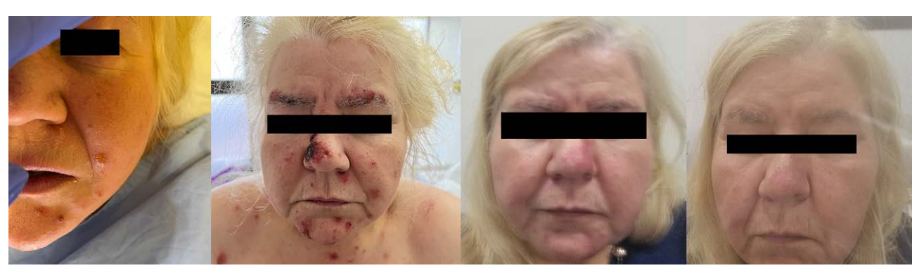
Figure 2: Progression of facial rash (from left to right): 9 days post exposure, 12 days post exposure, 5 weeks post exposure and 9 weeks post exposure

On presentation, she was commenced on oral flucloxacillin for presumed staphylococcal skin infection and discharged. However, after further worsening of the rash, she re-presented within 24 hours and antibiotics were changed to trimethoprim-sulfamethoxazole.