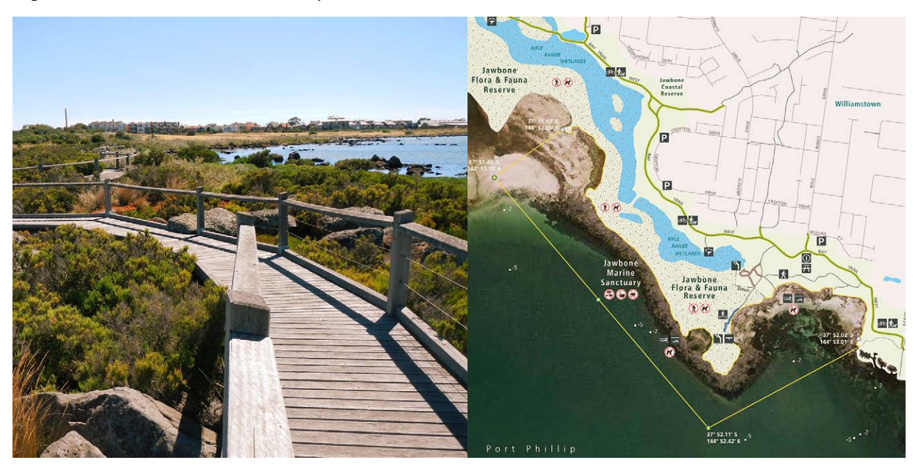
a

She reported no prior history of any rashes after swimming. This was her first occasion swimming in the Marine Sanctuary, although she swam regularly during summer months at beaches in Port Phillip Bay.