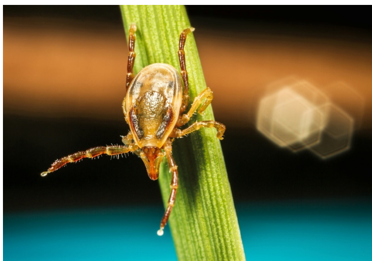
Female Ixodes holocyclus photograph above

Paralysis Ticks are not particularly mobile, and rely on passing animals for a blood meal. The Paralysis Tick will crawl up the stems of grasses or along branches and 'perch' ready to latch on to a passing animal, including humans. They rarely climb higher than 50 cm in their habitat, so do not drop out of trees, despite this common belief. However, after landing on a person or animal they can walk up the body and attach to the head area.